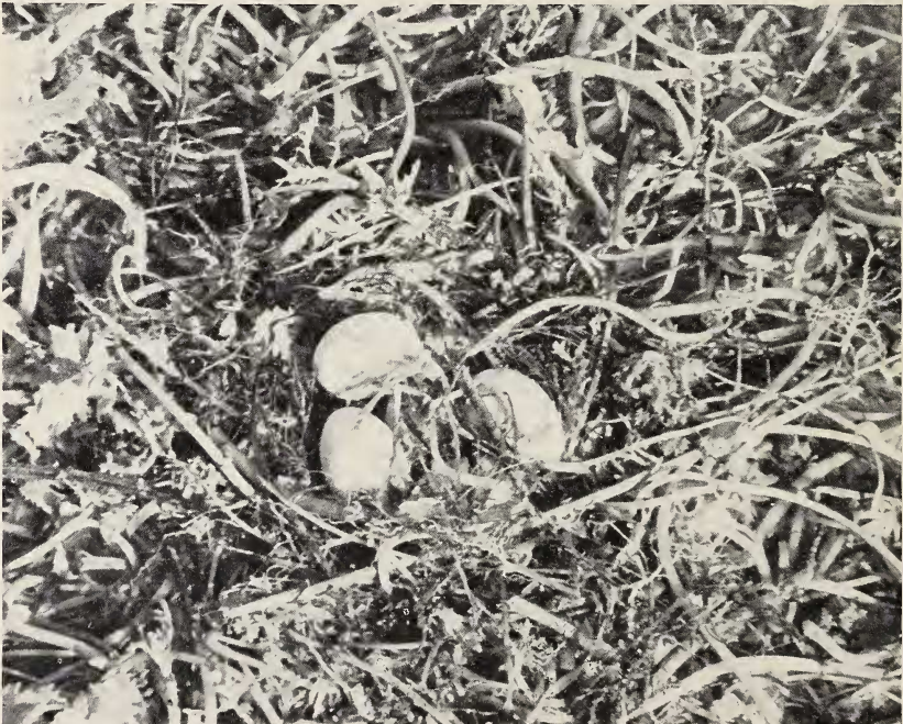
Fig. 5. Nest with eggs only partly covered up by departing bird.